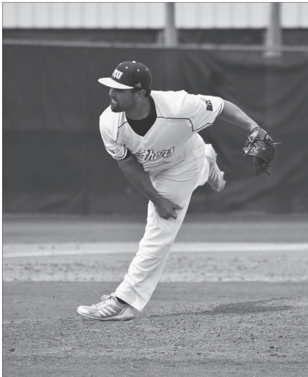
ROBERTO JIMENEZ/THE BEACON

The baseball team sits at 12-12 after dropping their second straight SBC series. The team's pitching has been the achilles heel with a 4.79 ERA, good for last in the conference.