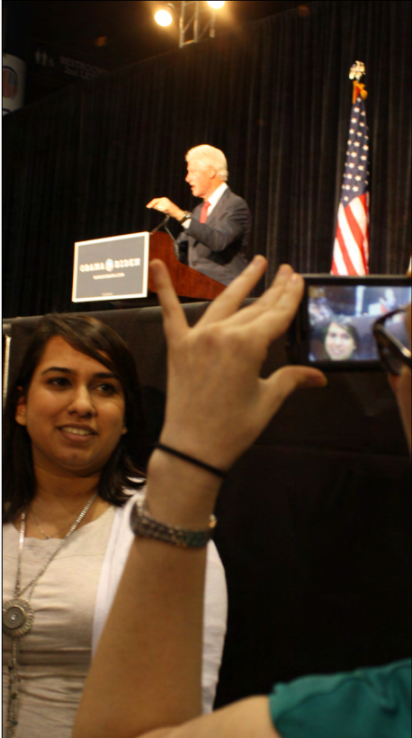
MELHOR LEONOR/THE BEACON