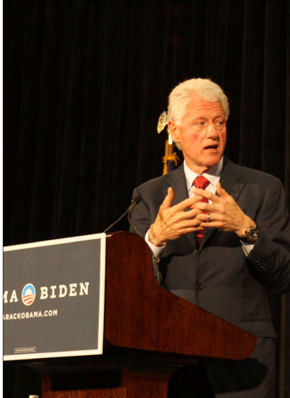
MELHOR LEONOR/THE BEACON