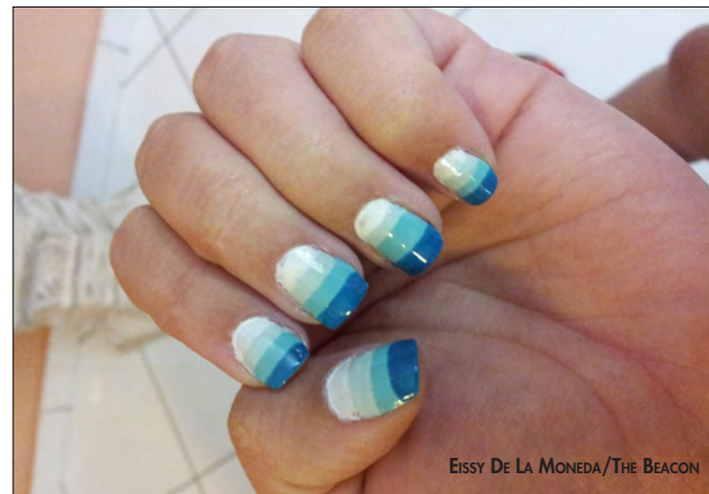
ESSY DE LA MONEDA/THE BEACON

Students are getting their nails done with a variety of different designs, ranging from simple shapes to more detailed designs of fruits, space, animals and more.