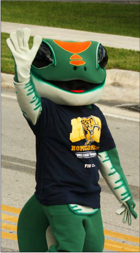
MELHOR LEONOR/THE BEACON