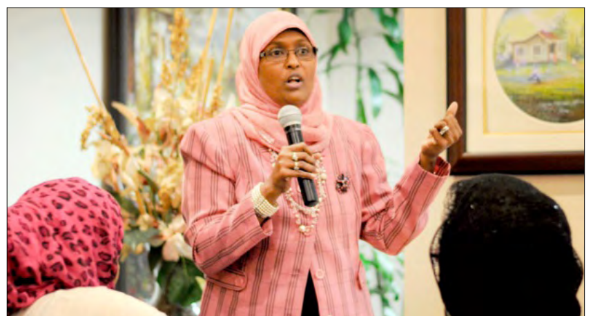
SANA ULLAH/THE BEACON