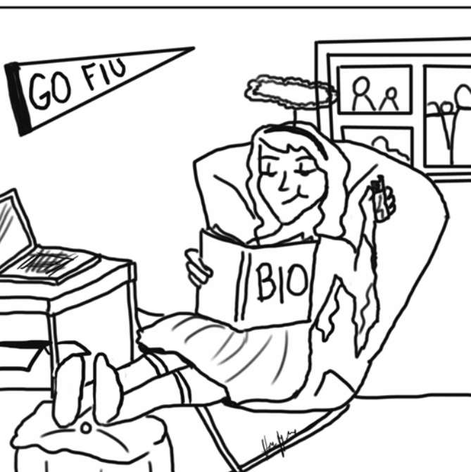
ILLUSTRATION BY HOLLY McCOACH/THE BEACON