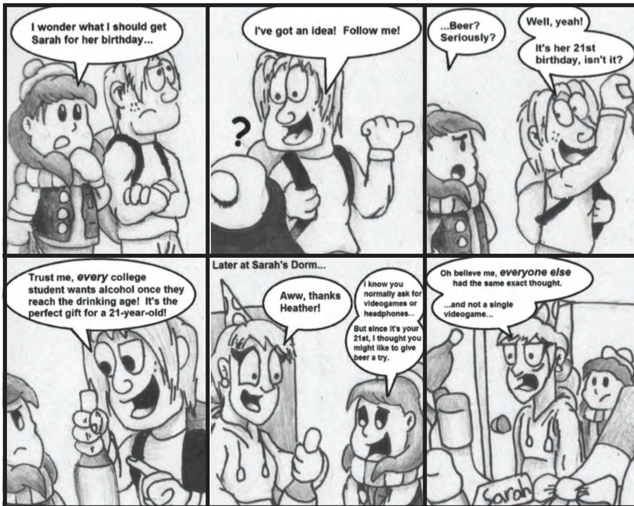
ILLUSTRATION BY CHRISTIAN SPENCER/THE BEACON