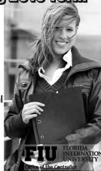
FIU FLORIDA INTERNATIONAL UNIVERSITY Office of the Controller

Student Financial Offices (PC120 or ACI 140) E-Mail: stufinan@fiu.edu Phone: (305) 348-2126