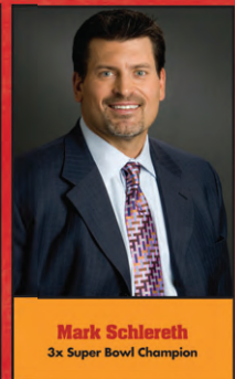
Mark Schlereth 3x Super Bowl Champion