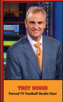
TREY WINGO Famed TV Football Studio Host