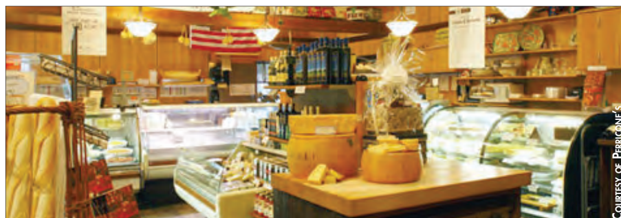
The Perricone's Marketplace sells many of the featured ingredients as well as deli sandwiches and gourmet desserts.