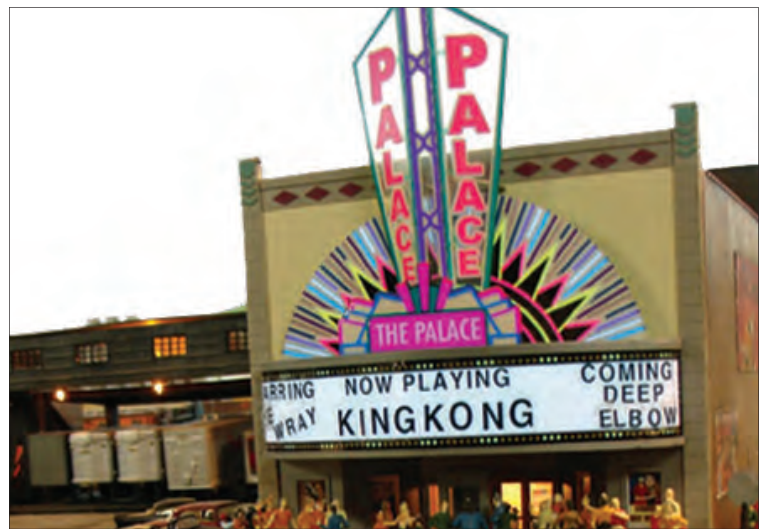
GENEVIEVE STEEL/THE BEACON