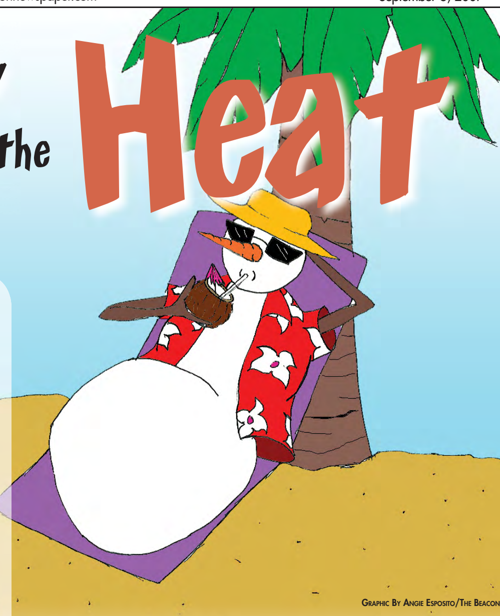
GRAPHIC BY ANGIE ESPOSITO/THE BEACON