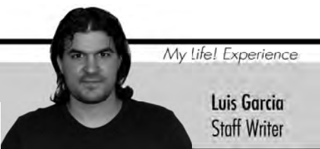
My Life Experience