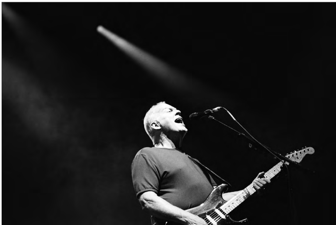
LIVELY NIGHT: David Gilmour, guitarist and vocalist of Pink Floyd, released his latest DVD Remember That Night - Live at the Royal Albert Hall on Sept. 20. The DVD features guest performances by David Crosby and Graham Nash.

There are a number of special features on the second disc, which