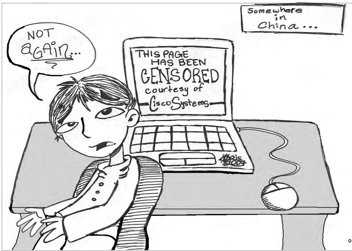
CARTOON BY IRIS AMELIA/THE BEACON