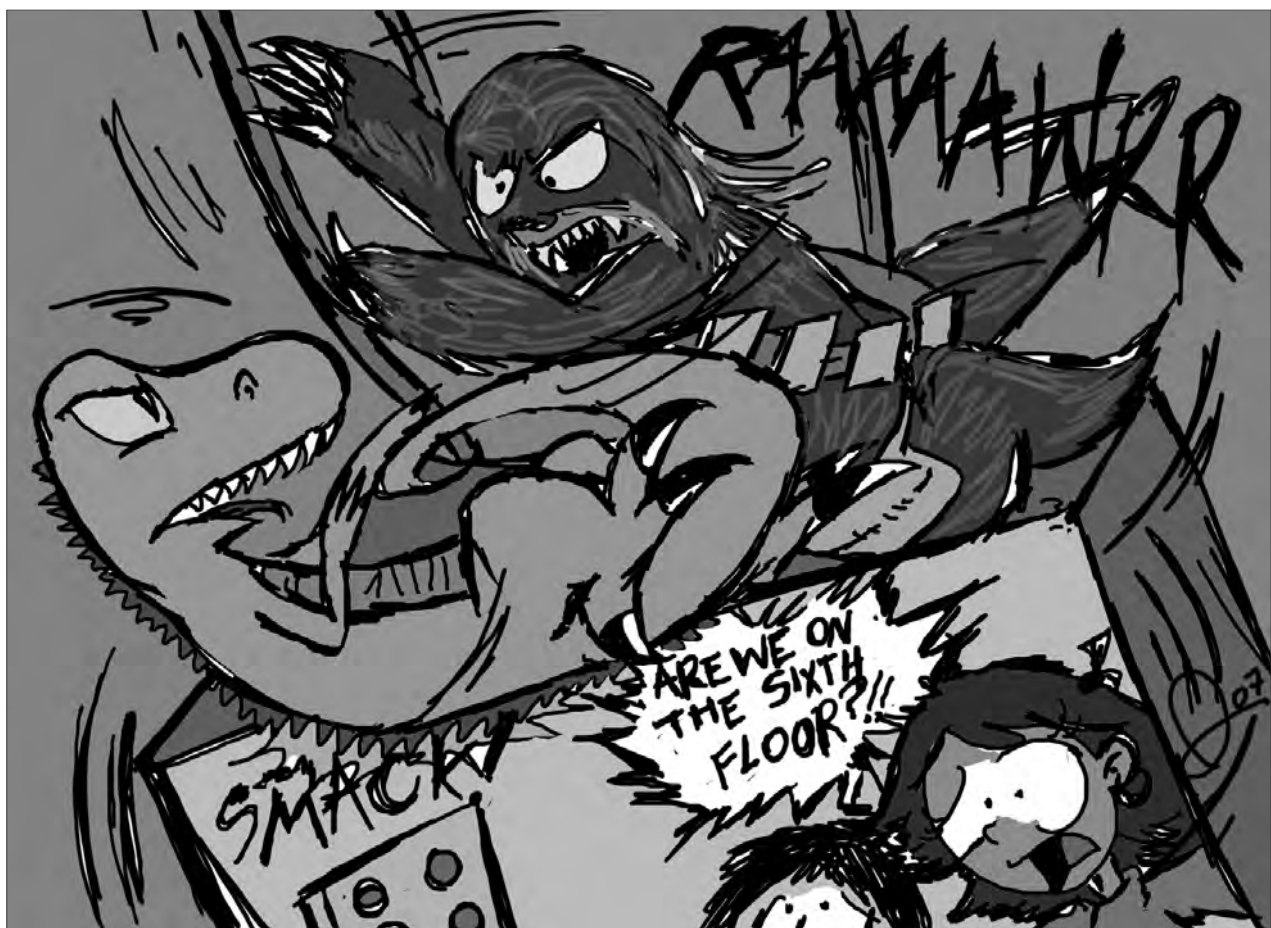
CARTOON BY IRIS AMELIA/THE BEACON

Living in apartments and duplexes all of my life, the walls, even in the oldest buildings, never felt as thin as Lakeview's