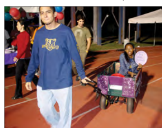
GAUDRY PUECHAVY/THE BEACON