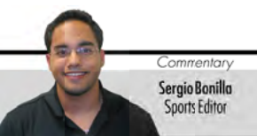
Commentary Sergio Bonilla Sports Editor

The 2007-08 season for the Golden Panthers draws parallels to the Greek mythology of Sisyphus. Like Sisyphus, the Panthers roll their huge boulder of burden up a hill towards victory only to have it roll back down as soon as they near the top.