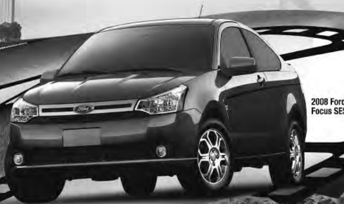
2008 Ford Focus SES

$500 student bonus cash www.FordDrivesU.com/College