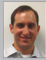
ADAMA WASCH STAFF WRITER