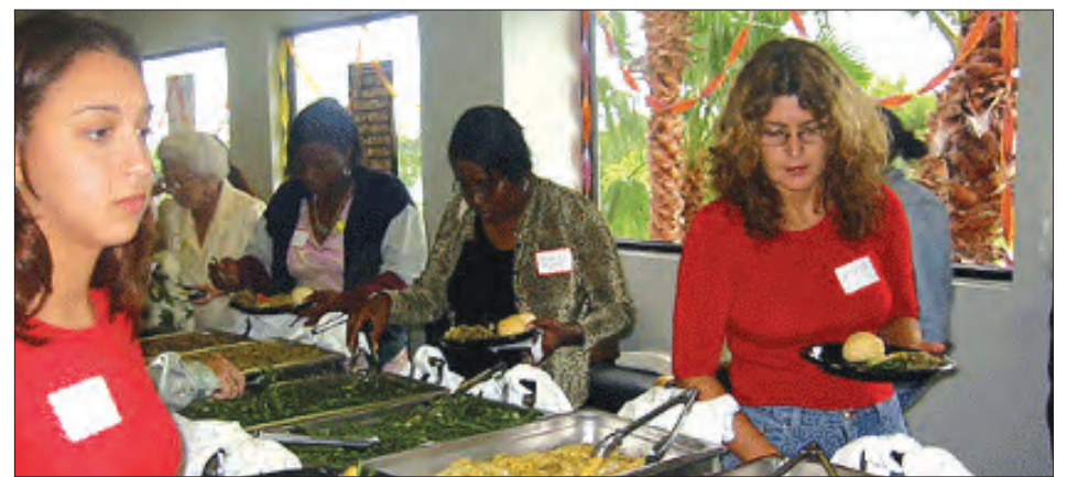
WORLD CUISINE: Students and faculty taste dishes representing different countries and cultures at last year's Diversity Awareness Day.

According to SPC, the event's purpose is to make students aware of the benefits of cultural diversity, to stimulate them to