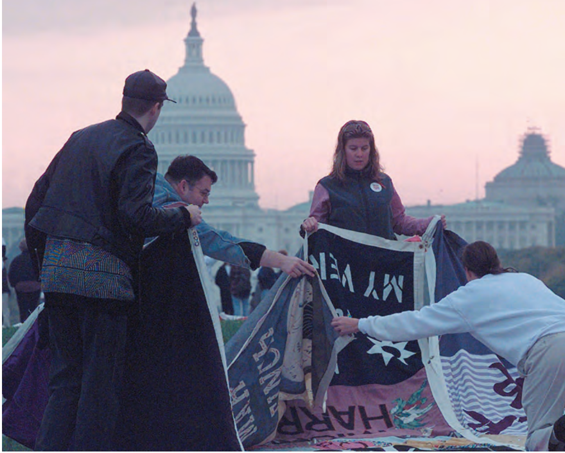
IN MEMORIAM: Volunteers set up a quilt bearing the names of 70,000 AIDS victims in the Washington, D.C., National Mall, a familiar staple of the annual World AIDS day on Dec. 1.