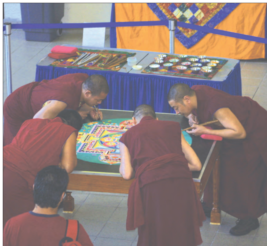
HEAVENLY GRAINS: Tibetan buddhist monks worked diligently on the mandala for three days before removing it to consecrate the ritual.