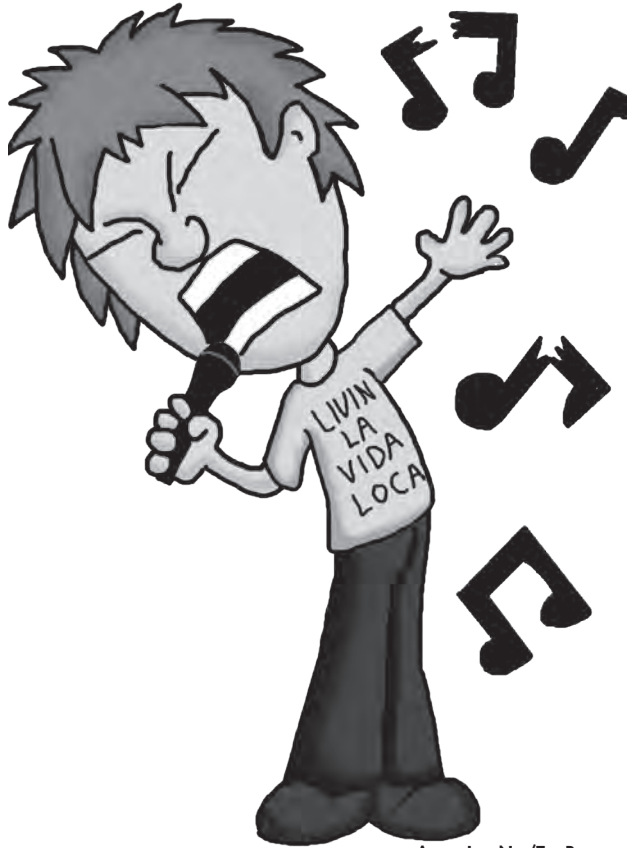
ART BY LUIS NIN/THE BEACON

The show is scheduled to air in February 2005 on Sunday nights.