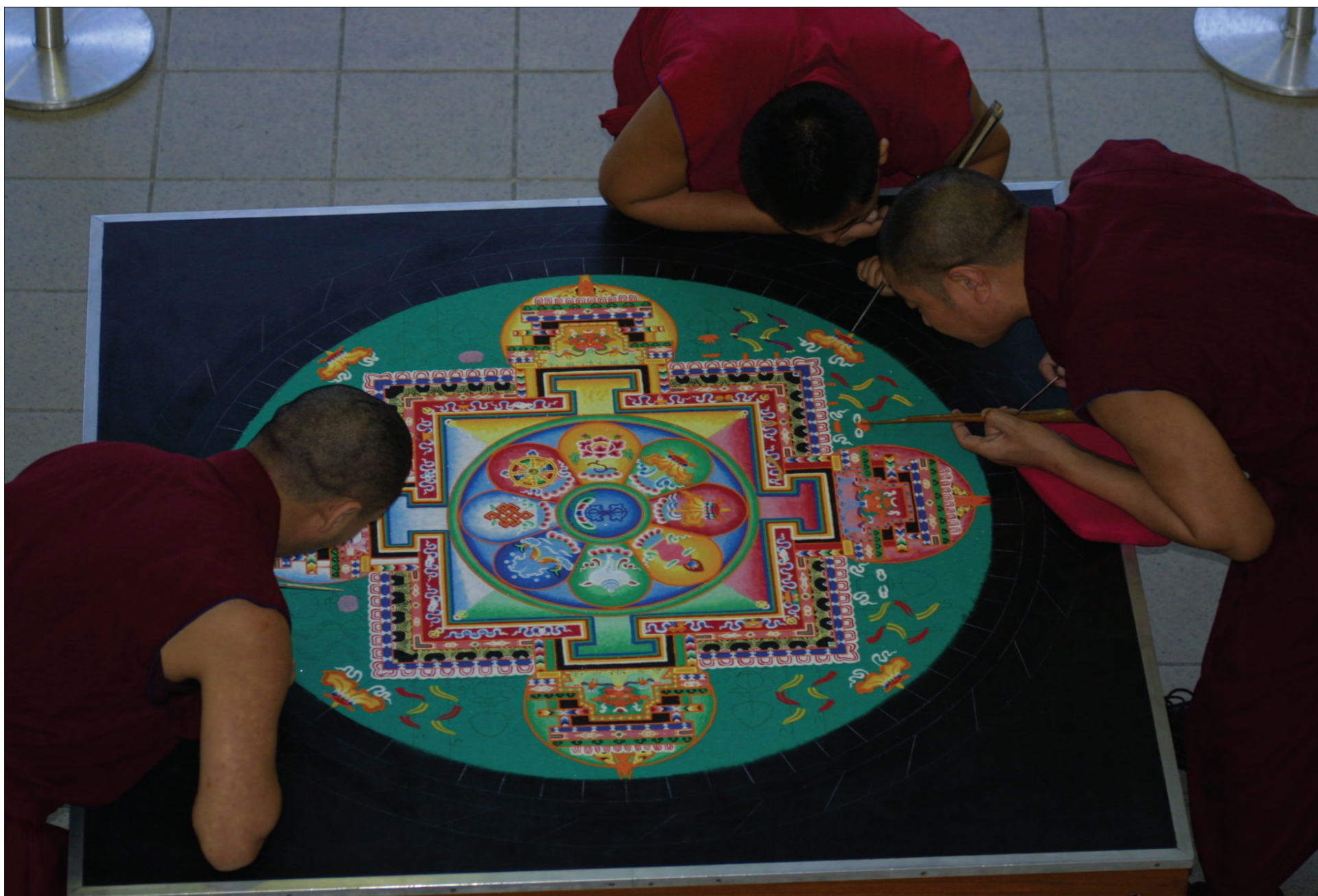
SAND ART: The mandala represents different things to people. It represents art for artists, music to musicians and dance to the dancers.