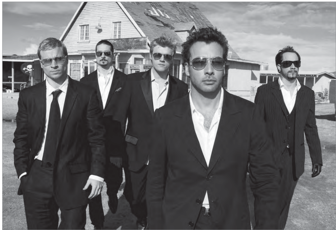
BOYS TO MEN: (From left to right) Brian Littrell, Kevin Richardson, Nick Carter, Howie Dorough, A.J. McLean. The Backstreet Boys make a comeback with their much anticipated new album.

It is a touching song about loss, and I found myself in tears listening to it because my own grandfather passed away this summer. On the other end of the spectrum is one of the most romantic songs on the album, "Safest Place To Hide" on which miraculously all five men get lead vocals. (Yes, even Kevin!)