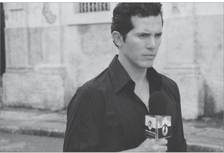
JOHNNY BOY: John Leguizamo stars in "Cronicas" as Manolo Bonilla, an ethics-bending journalist in search of a serial killer.