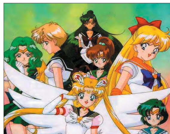
SAILOR MOON COURTESY PHOTO

I can still remember trading cards with my fellow fanatics during recess, going on eBay to buy posters and action figures and rushing home after school everyday to watch these five Japanese heroines "fighting evil by moonlight; winning love by daylight."