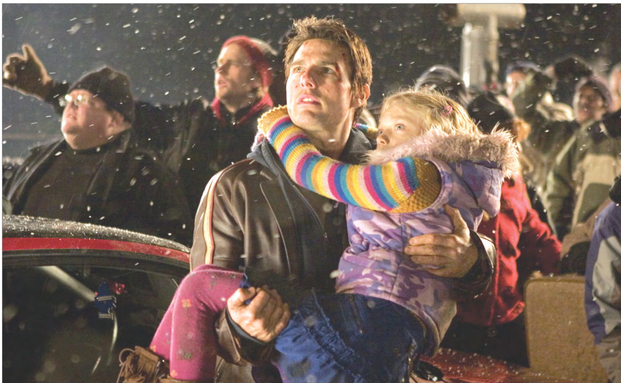
DOOMS DAY: Steven Spielberg's adaptation of H.G. Wells' novel, "War of the Worlds," scares audiences into thinking "we are not alone."