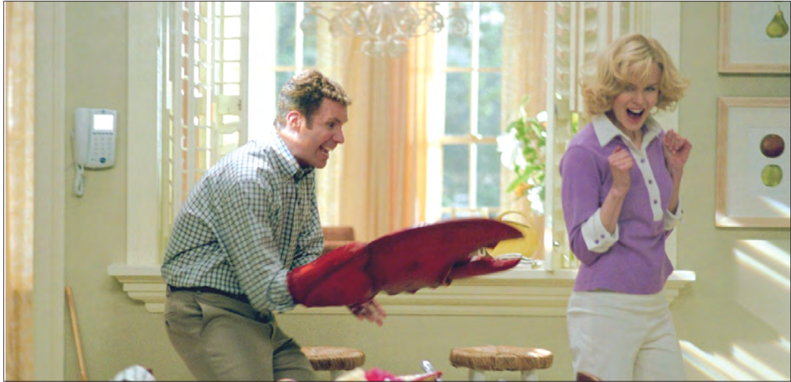
WITCHY WOMAN: Will Ferrell and Nicole Kidman star in "Bewitched," the quirky adaptation of the popular 60s sitcom.

Ferrell and Kidman do a remarkable job of stepping