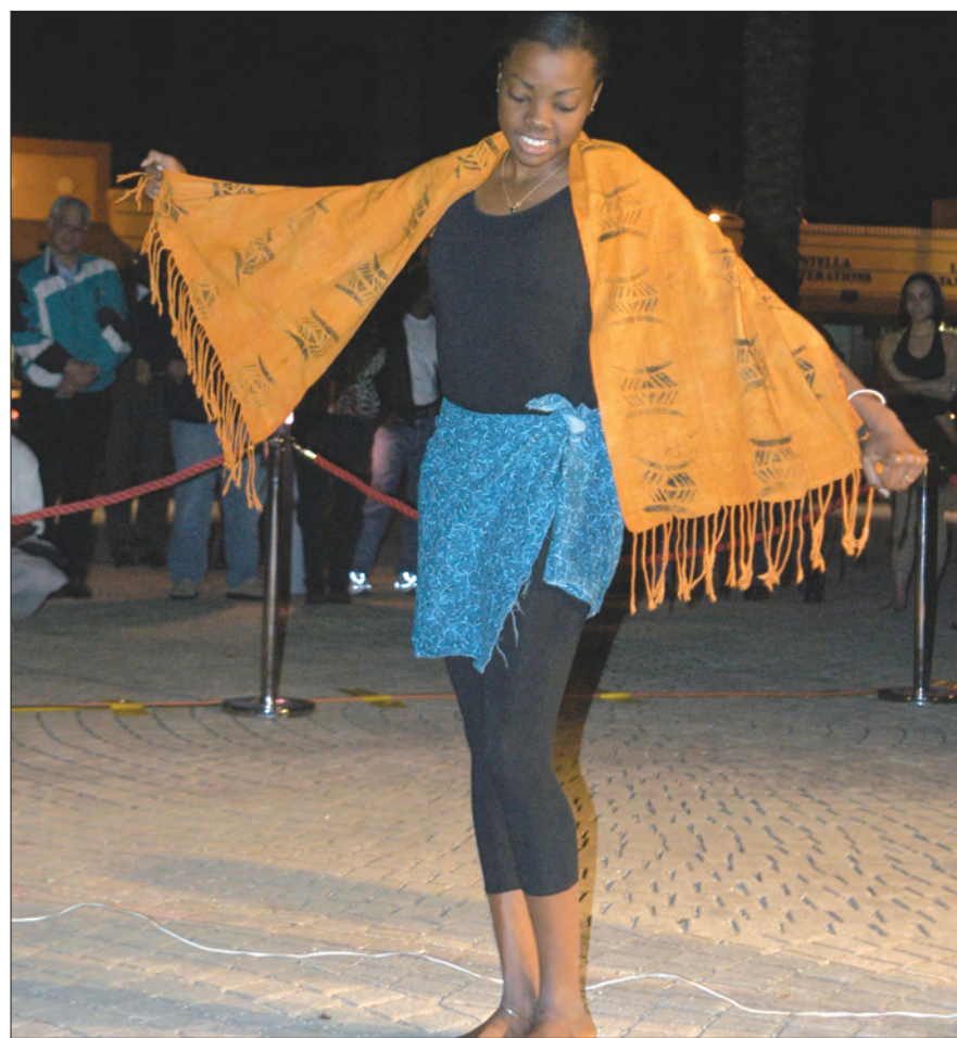
CELEBRATION: Students of FIU, Miami Dade College, Johnson and Wales, and Barry University gather at the MOCA Museum of Contemporary Art in North Miami to celebrate Martin Luther King’s birthday on Jan. 20. A student from Miami Dade participates in an interpretive dance inspired by the children’s book “The Giving Tree”.