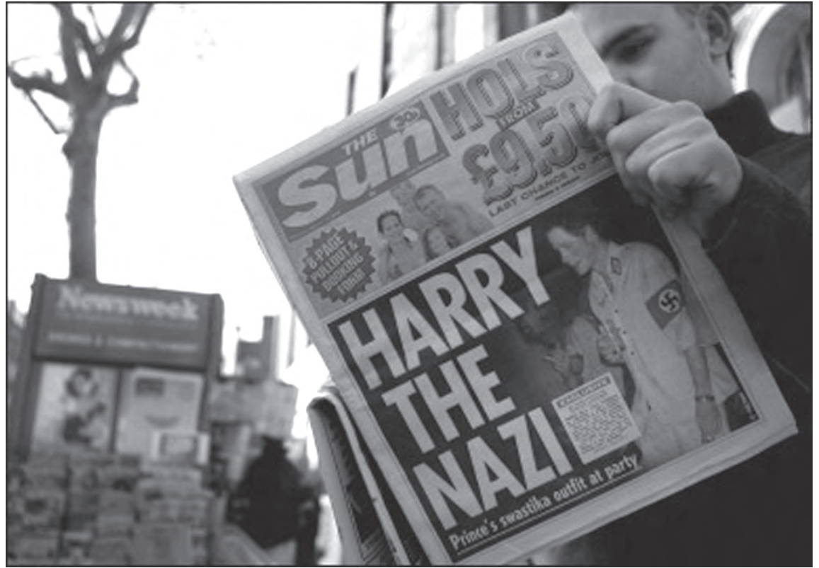
A ROYAL MISTAKE: Prince Harry was on the cover of The Sun magazine after wearing a Nazi uniform to a friend's costume party.

It is hard to believe that Harry's faux pas was done maliciously or with any anti-Semitic intent. Prince Harry has also made his regrets and apology clear. Nevertheless, it is doubtful that he woke up the next morning, saw himself all over