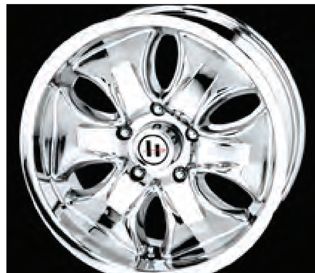
SPINNING IN CIRCLES: Many students find popular spinning hubcaps like these annoying and tacky.