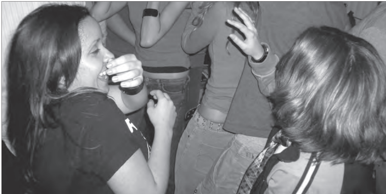
PARTY HARDY: When college students have so many other things going on, like partying and sleeping, who has time for class anymore?

When we do go to class, however, it’s always an interesting experience because the classroom is like a whole other world. You’re sitting in the back of a