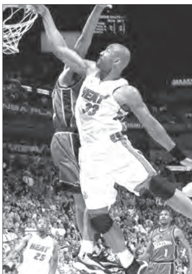
DIFFERENT TIMES: Alonzo Mourning will have to adapt to coming off the bench for the Heat now.

Now, we need to give him the opportunity to come back and finish his career where he belongs - with the Heat.