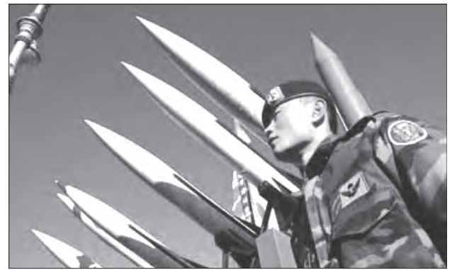
ON WATCH: Since North Korea declared that it possessed nuclear weapons on Feb. 10, the U.S. government will be watching the country closely.

In addition, A.Q. Khan, the nuclear scientist who headed the Pakistani weapons program and ran an international nuclear mate-