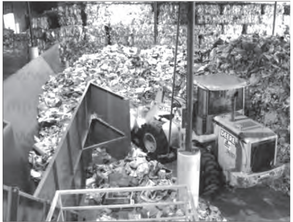
RECYCLING DEPOT: A front-end loader moves paper, plastic and glass toward a sorting machine at the Abitibi sorting facility in Fort Worth, Texas.