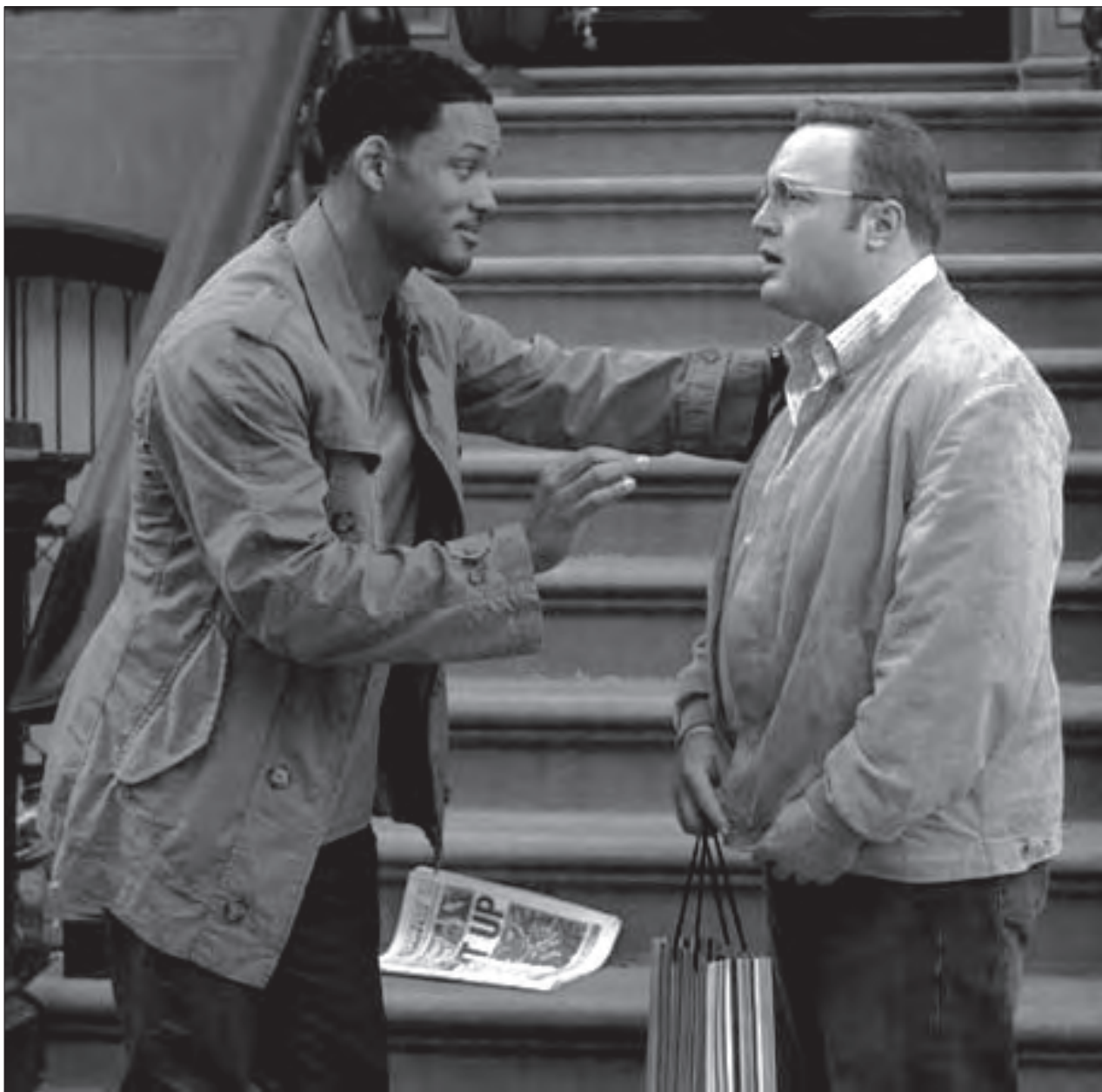
HOOKED ON YOU: Will Smith plays a dating doctor who teaches men how to woo women the right way, in his new comedy, “Hitch.”