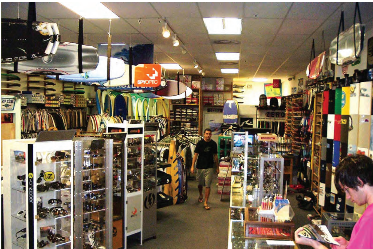
HANG TEN! Island Water Sports, one of a handful of surf shops in South Florida, offers its customers everything from surf boards to sunglasses.

So the next time you're on your way to the beach or just killing some time in between a class, don't forget about Island Water Sports, where the waves have been breaking in Miami for over 21 years.