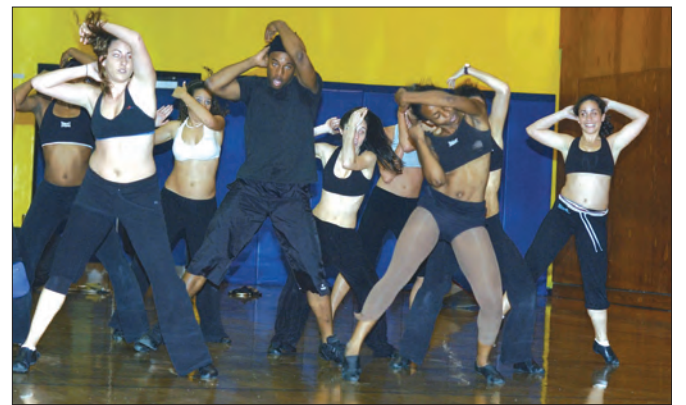
LET'S DANCE: Several members of the FIU Golden Dazzlers dance team practice complicated dances moves in order to prepare for the national competition in April. The dazzlers placed seventh out of 20 squads in the NDA video entry.