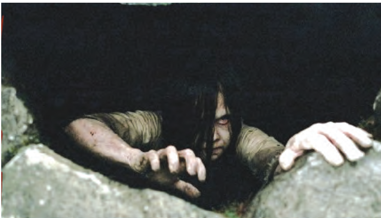
HEY THERE, HOT STUFF: "The Ring 2", starring Naomi Watts and David Dorfman, leaves audiences with less thrills and chills than its predecessor.

The director (Nakata Hideo, who directed the original Japanese versions of both films, "Ringu", and "Ringu 2", but not the American version of the "The Ring") tries to throw in some surprises