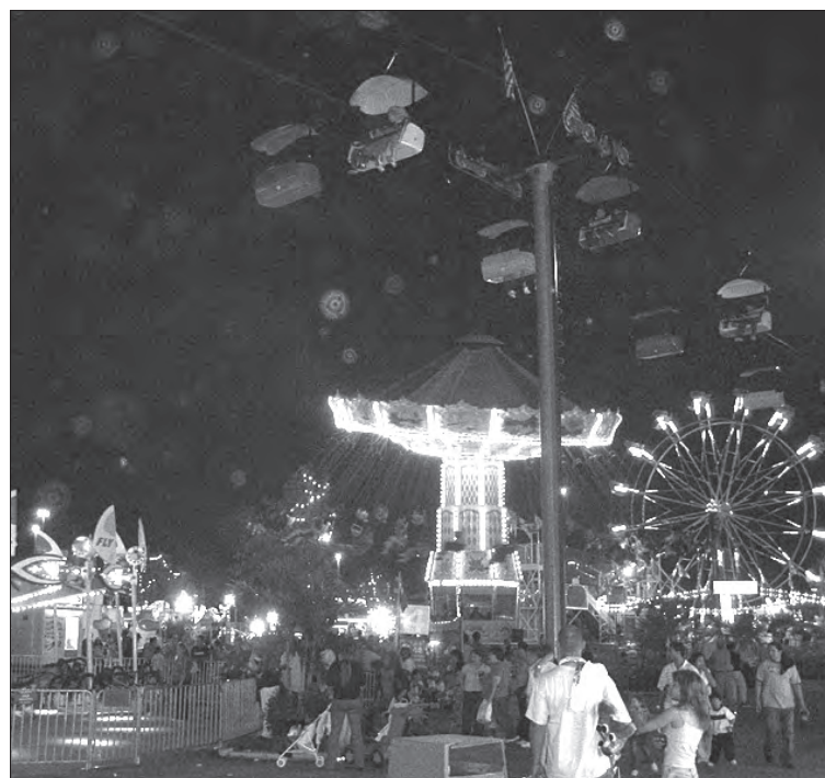
FUN AND GAMES: Fair patrons flock to the fair for a night of fun, food and carnival rides.