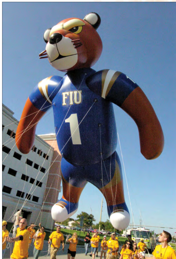
EDDIE ZENG/THE BEACON