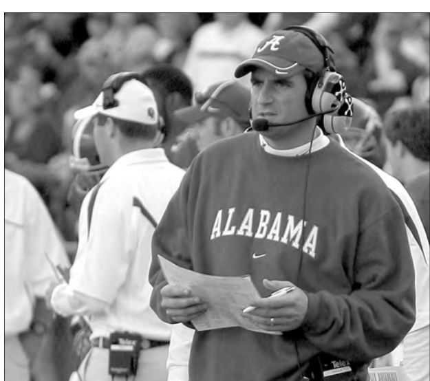
JUST LIKE DAD: Mike Shula, son former Dolphins coach Don Shula interviewed for Miami Dolphins head coaching vacancy on Jan. 13.

Shula was a Dolphins ballboy when his dad coached the team. He has spent 15 years as an NFL assistant, most recently in 2000-02 as Miami's quarterbacks coach. Former Dolphins coach Nick Saban is coaching the Crimson Tide.