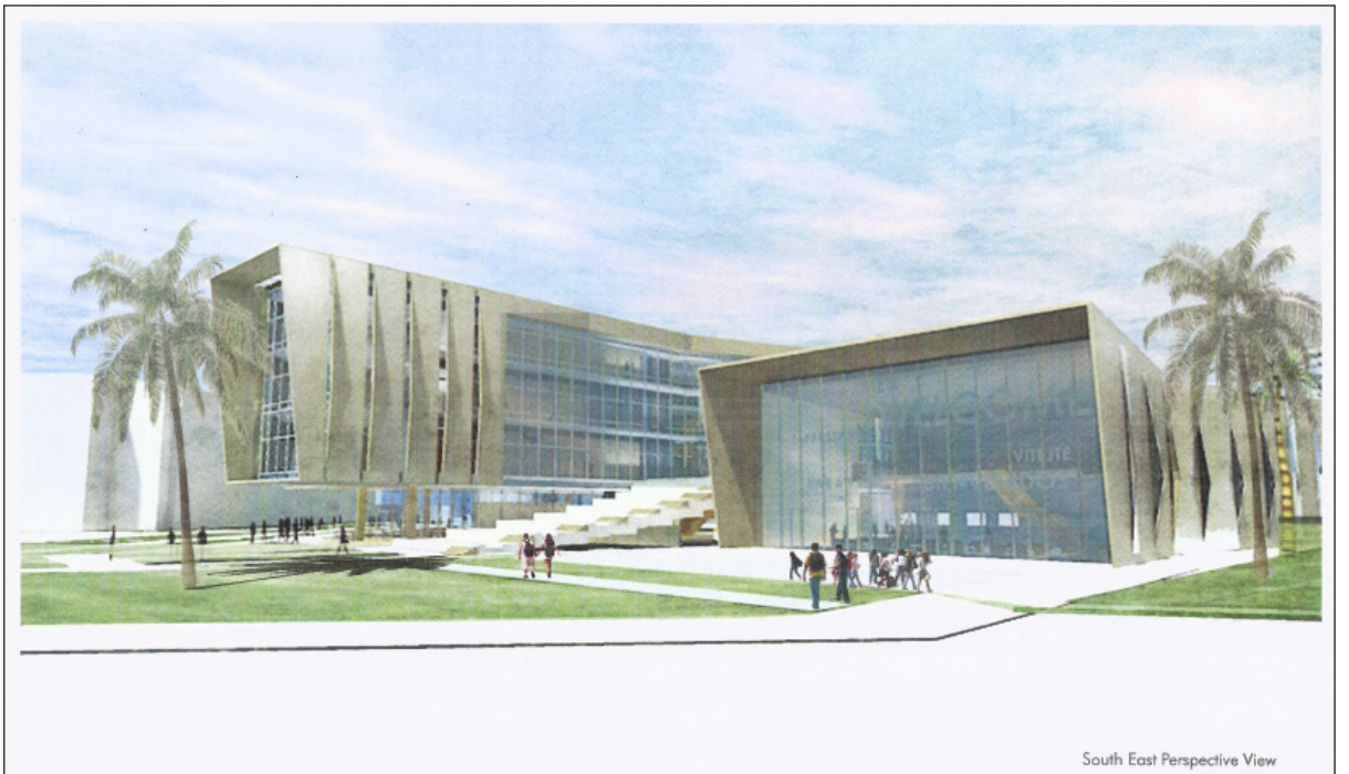
South East Perspective View