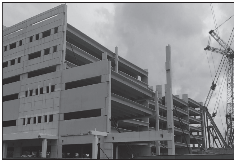
RHYS WILLIAMS/THE BEACON

Parking Garage 6 will include many stores and classrooms including the newest branch of EXN Nutrition. It will open in the Spring of 2015.