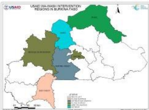
WA-WASH Intervention Zones in Burkina Faso