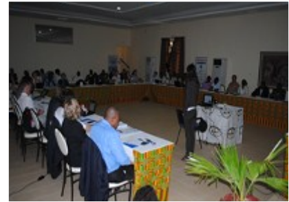
Participants at the Capacity Building Forum.

The last day, stakeholders from Burkina Faso, Ghana and Niger were invited to join the Forum, in order to share their view on the USAID WA-WASH Capacity Building Framework. Over 80 persons participated in the debate, discussing how the sector can best benefit from those activities and seeking ways to institutionalize the capacity building content developed under WA WASH to ensure it survives the Program.