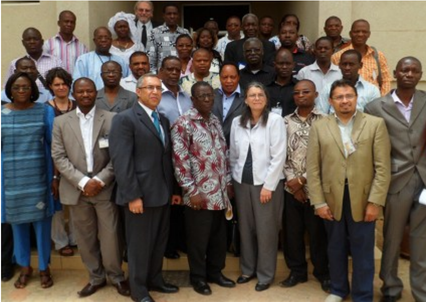
Participants at the WIS XIII Summit

Africa hosted the 13 th Water Information Summit on April 11-13, 2012. It was an opportunity which gathered, in the Burkina capital "Ouagadougou", information specialists, web site managers, scientists, policymakers, and other stakeholders, to discuss the regional perspectives on water information, to present and discuss case studies of the implementation of international, national, regional, and local water information systems and to examine the use of the Internet to disseminate water information.