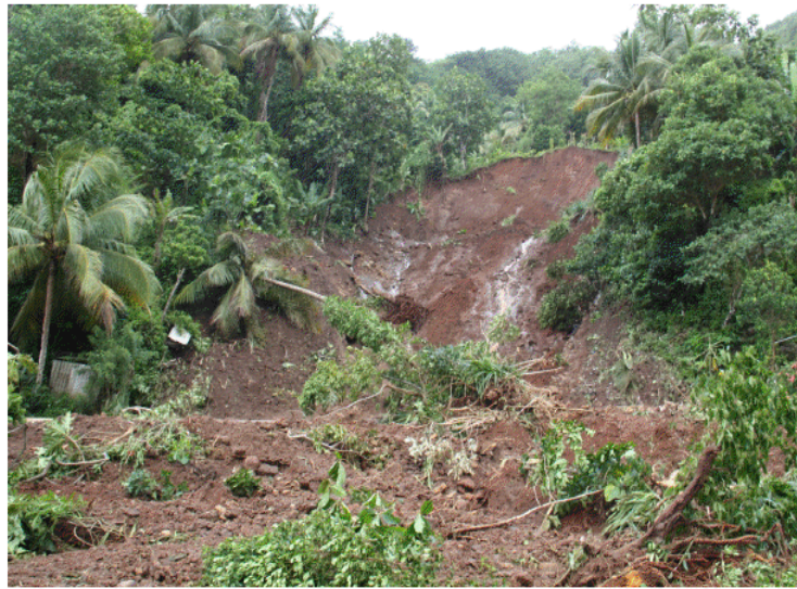
Figure 2 A landslide in Dominica after the return of the rains