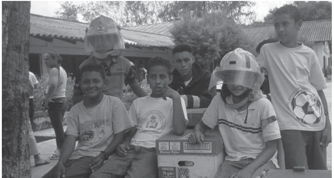
School children in Honduras in a drill practice