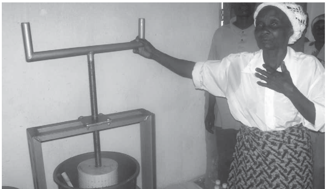
A member of the 'Sekandikudyele' group with a juice extracting machine

Tearfund (In partnership with River of Life Relief and Development - ROLDD)