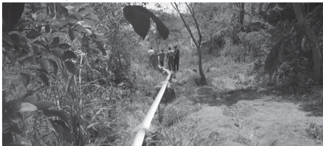
A pipeline channeling water for domestic use and irrigation

Christian Aid (In partnership with the Evangelical Lutheran Development Service - ELDS)