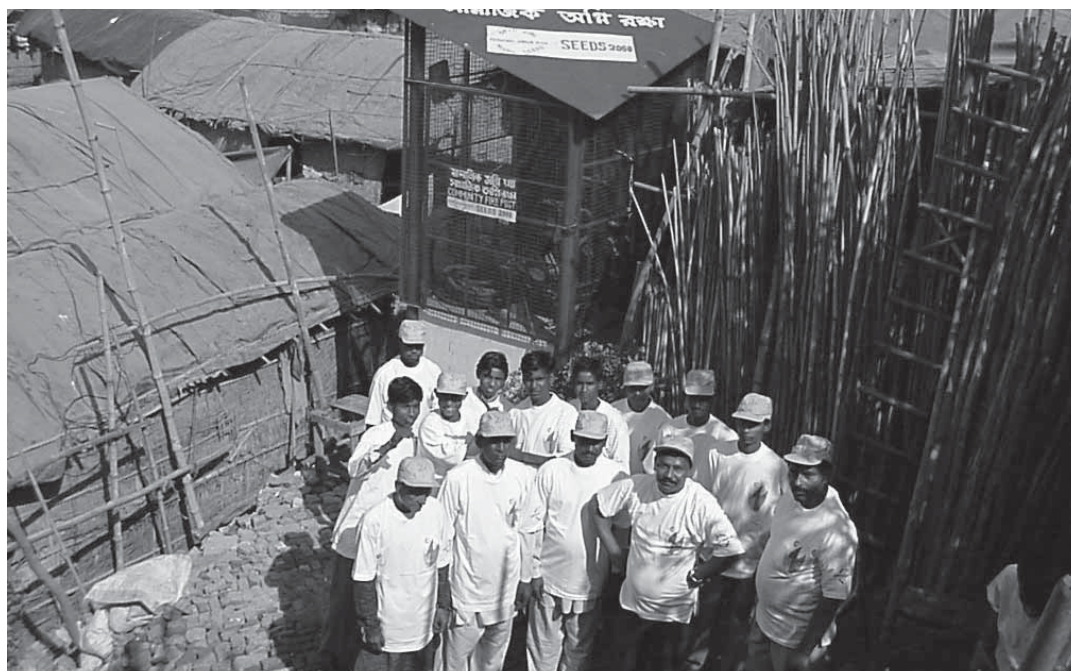
The community fire post

SEEDS India (In partnership with the Indian Institute of Public Administration, the National Centre for Disaster Management, the Centre for Development and Emergency Practice - Oxford Brookes University, and the Oxford Centre for Disaster Studies)