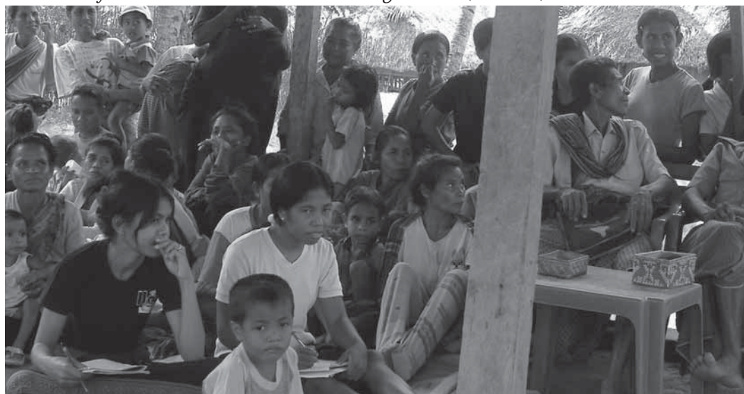
Project beneficiaries from the Indonesian province of Nusa Tenggara

Community Association for Disaster Management 12 (PMPB)