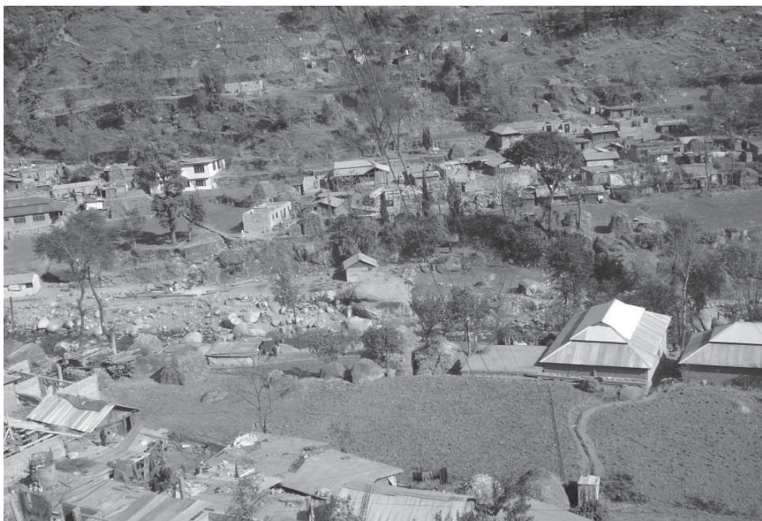
One of the affected villages of Mansehra District

The Concern Worldwide Pakistan Programme (CWPP) Concern Worldwide - Pakistan 20 (In partnership with HAASHAR)