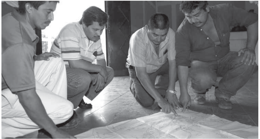
A community going over its risk map

The National Network for Disaster Risk Reduction in Central America Oxfam America (In partnership with the National Network for DRR)