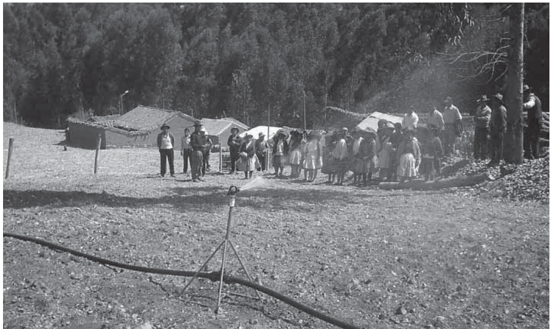
Appropriate irrigation techniques promote good water management

(In partnership with Huaraz Provincial Government, the Ministry of Agriculture, and the National University of Santiago)