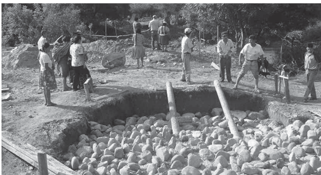
A demonstration project carried out by Care International in Bolivia