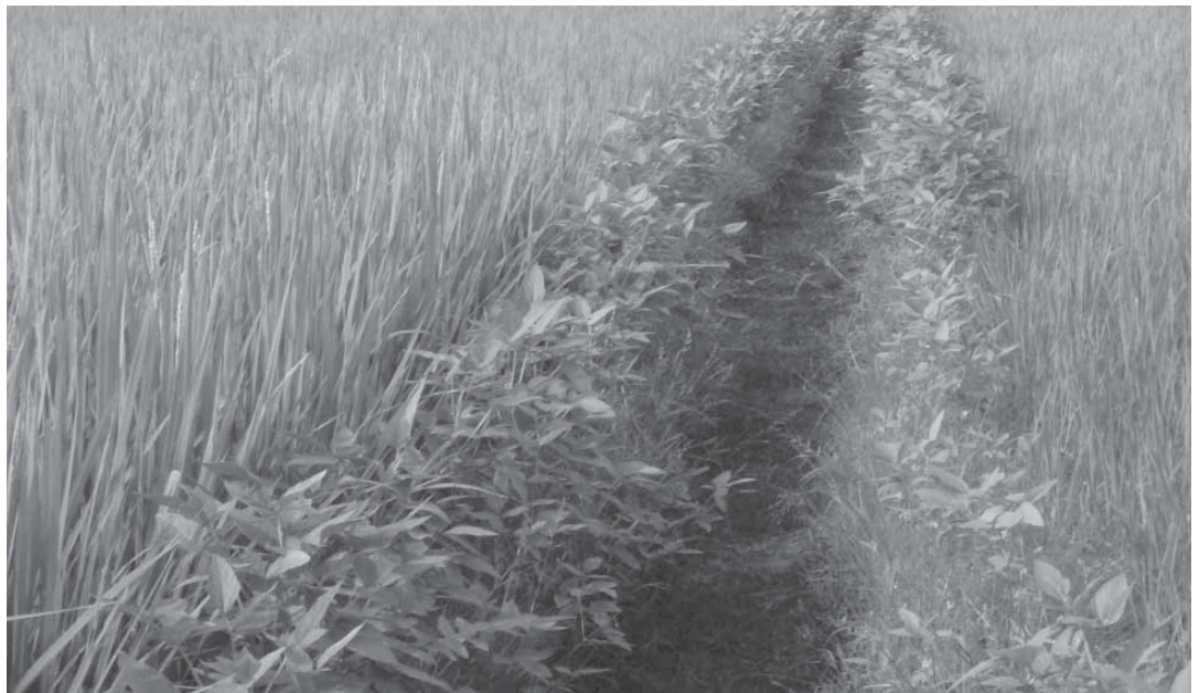
A reliable harvest due to improved irrigation

Practical Action - Nepal (In partnership with MADE/Nepal)