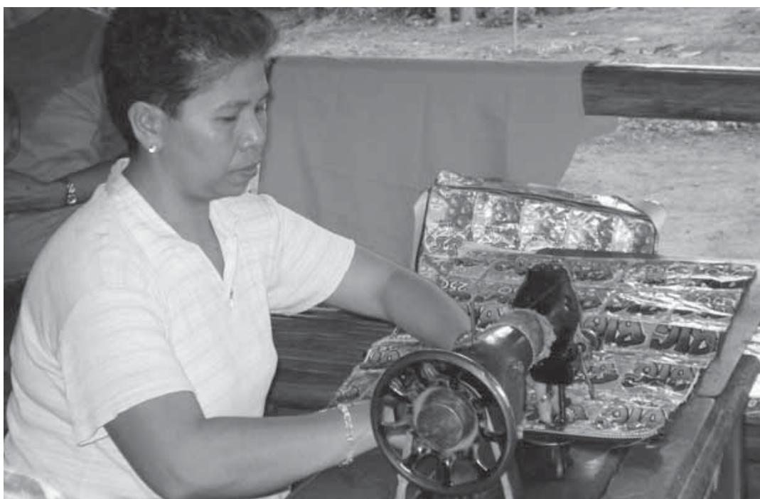
One of the Buklod Tao community members

(In partnership with Buklod Tao 22 , Inc.)