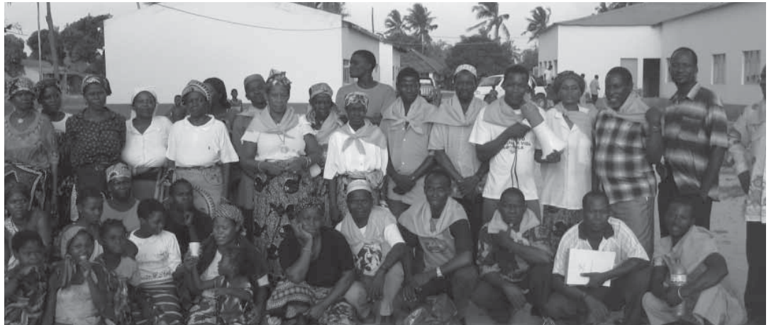
A local Disaster Management Committee in Moma

(In partnership with the National Disaster Management Institute of Mozambique - INGC 18 )