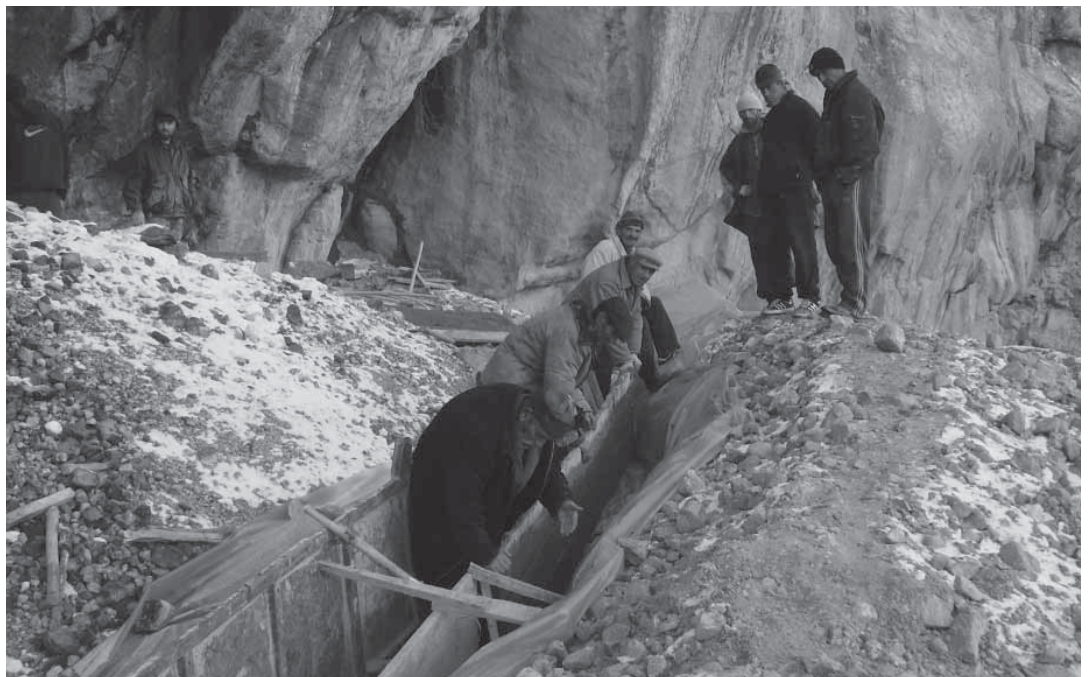
Construction of a channel to reduce the risk of underground flooding

(In partnership with the Aga Khan Foundation – United Kingdom)