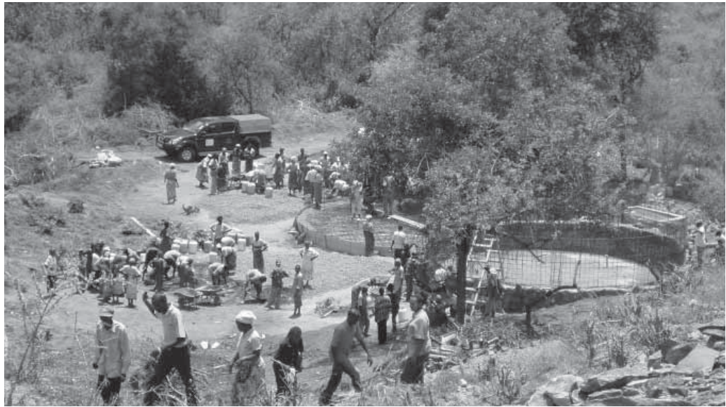
Water storage tanks under construction

Community-based rock rainwater harvesting and storage Welthungerhilfe (German Agro Action)