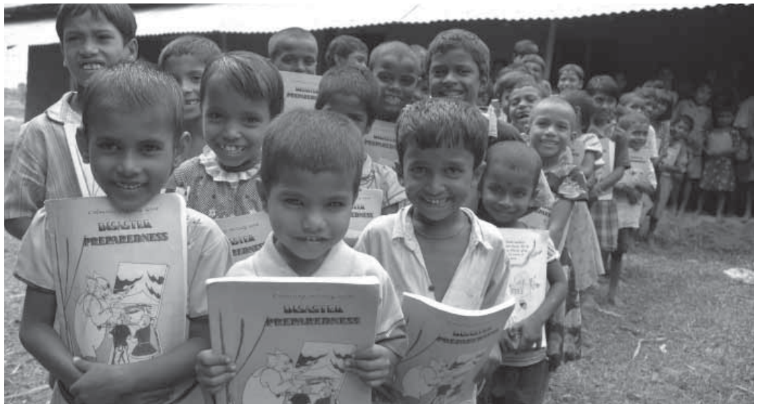
Children from the Malda District, India

World Vision – India (In partnership with World Vision UK, the Government of India and UNICEF)