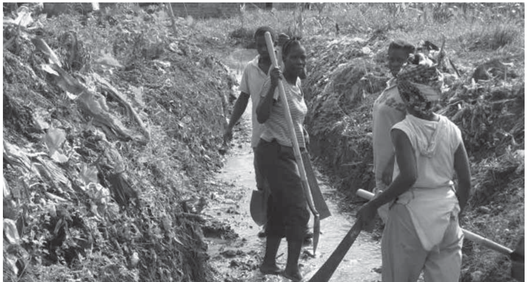
Drain cleaning to reduce potential for flooding and improve sanitation