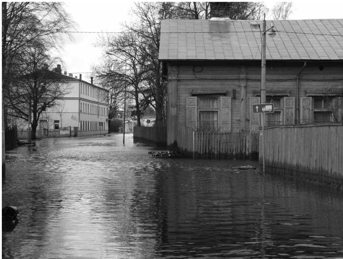
Flooding in Riga Latvia

government department that is responsible for all aspects of CCA or DRR and therefore, CCA and DRR policies must be implemented and incorporated into the policies of all sectors. Government offices often have mandates to address certain issues exclusively related to their office, which reduces the amount of time, and resources they can dedicate to cross-sectoral policies and programmes. Furthermore, most governments have bureaucratic policies and procedures in place, which limit their ability to work with other groups and government offices. An element of competition among different government offices exists, which is good in theory but is problematic when dealing with CCA, as the cross-sectoral nature requires cooperation. In Europe, as assessed by the 2009 HFA Regional Report, competition is further generated because of the “scarce