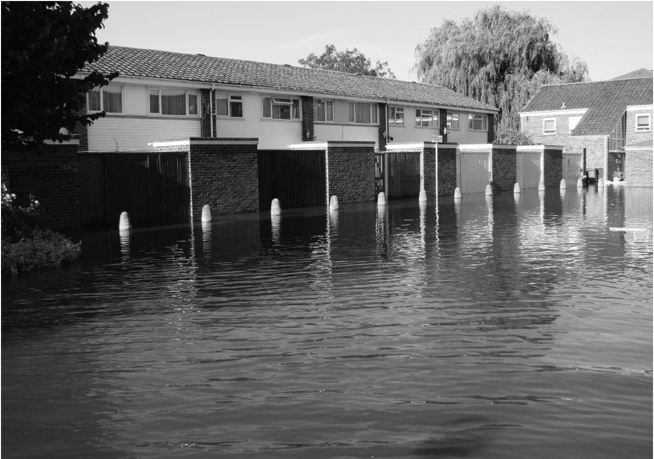
Flooded Houses in the United Kingdom

and evaluation of climate change policy options within the European Commission. Will look to identify the associated costs and effectiveness of an unchecked 5°C mitigation scenario and to develop and appraise a portfolio of longer-term strategic policy options.