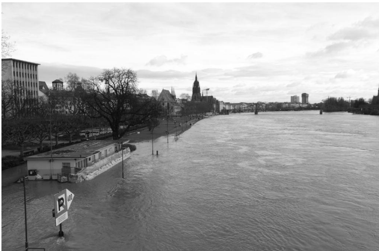
Flooding in Frankfurt 2011

the Flood Framework Directive and report to the Commission. Once the flood risk management plan is developed, Member States must update it regularly, generally on a six-year cycle. 30