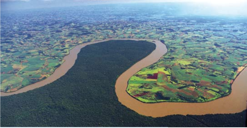
A bend in the Iguaco River shows the contrast between dense forest and agricultural expansion. The undisturbed forest on the near bank is part of the Iguacu National Park.