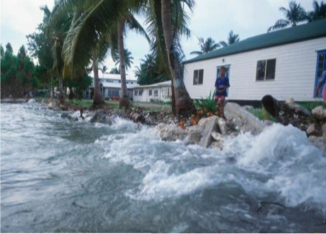
Waves from the atoll lagoon threaten buildings in Tuvalu, Funafuti, during exceptionally high tides in February 2002.

Environmental degradation, settlement patterns, livelihood choices and behaviour can all contribute to disaster risk, which in turn adversely affects human development and contributes to further environmental degradation. The poorest are the most vulnerable to disasters because they are often pushed to settle on the most marginal lands and have least access to prevention, preparedness and early warning. In addition, the poorest are the least resilient in recovering from disasters because they lack support networks, insurance and alternative livelihood options.