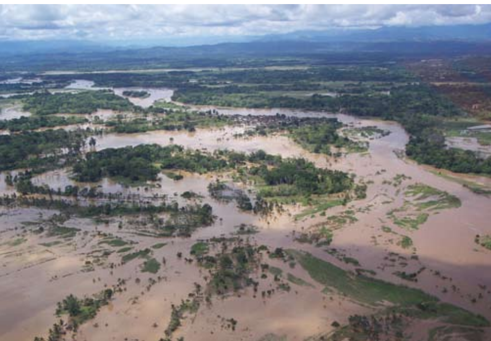
Flooding in the Sambava District of Madagascar. The 2006-2007 cyclone season in Madagascar has been particularly severe, affecting around one million people.

resilience against drought in arid and semi-arid zones. In the US, the Coastal America Initiative illustrates how government, private sector and other partners can join together to support broad-ranging wetland management efforts.