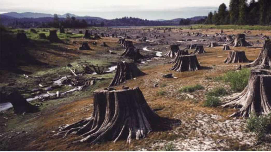
Loss of biodiversity leads to a decrease in ecosystem productivity, biological resources, ecosystem services and social benefits.

elaborated by the disaster reduction community also provides a valuable framework for analyzing patterns of vulnerability to environmental change and identifying opportunities for reducing that vulnerability.