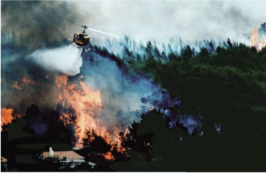
Fire fighters protect neighbouring communities in their response to a forest fire in France.

The integration of industry emergency plans with local emergency response plans into one overall community plan to handle all types of emergencies is the basis of a multi-hazard multi-stakeholder approach to emergency preparedness. In this respect, it is of the utmost importance to promote the involvement of all members of the community in the development, testing and implementation of the overall emergency response plan, promoting awareness of the underlying risks, and plan ownership.