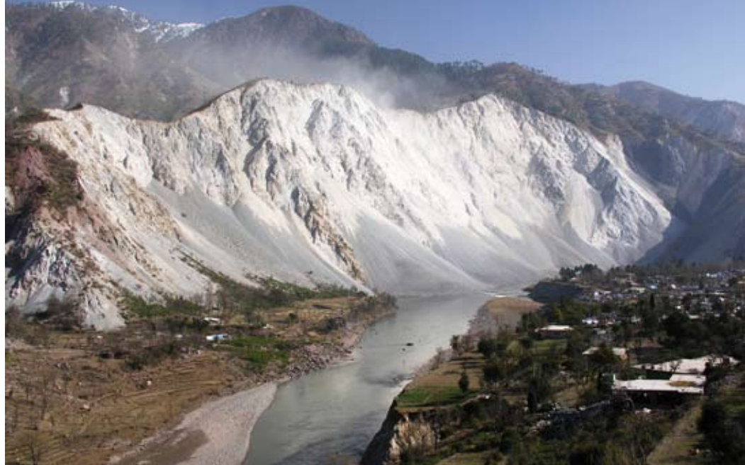
The October 2005 earthquake in Pakistan, which caused this landslide at Muzaffarabad, continues to present recovery challenges.