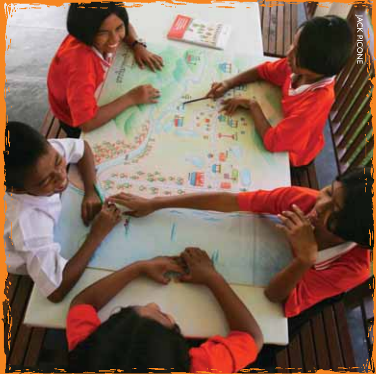
Students at Ban Talaynork School in Ranong province, Thailand, cross check a 'risk and resource' community map they developed showing areas that are at risk and those that are safe.

Education provides a natural space for providing disaster risk reduction (DRR) activities. Following the Indian Ocean tsunami in 2004, part of Save the Children's response focused on children's participation in DRR. This programme had several components that included involving children in developing preparedness and evacuation plans and making DRR a part of primary and secondary school curricula. Integrating DRR into normal school-day activities promotes sustainability of the messages and reduces the burden on children. Schools can build a culture of prevention that helps children to understand their environment, fosters awareness and contributes to risk reduction. In Thailand, children produced DRR posters with a story book called Albert Rabbit and a puppet show. These methods focused on children in schools and were designed to support children in spreading DRR messages.