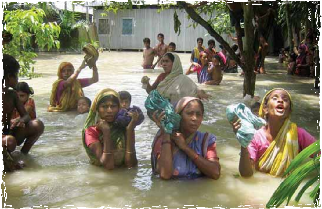
Flood-affected villagers in Sirajgong, Bangladesh, August 2007

However, there were still considerable barriers to implementation. Even where good policies had been generated, they were not necessarily implemented, and ad hoc approaches prevail. 41