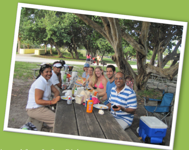
Pictured from Left to Right