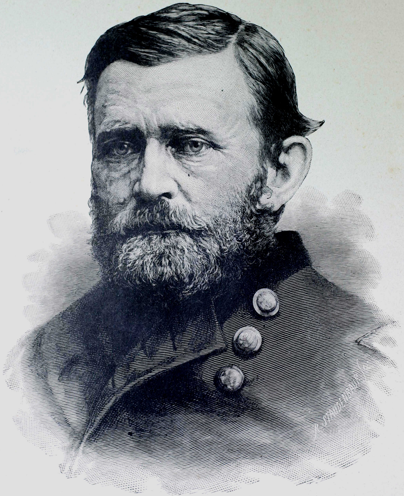
ULYSSES S. GRANT.—FROM A PHOTOGRAPH TAKEN IN 1865.