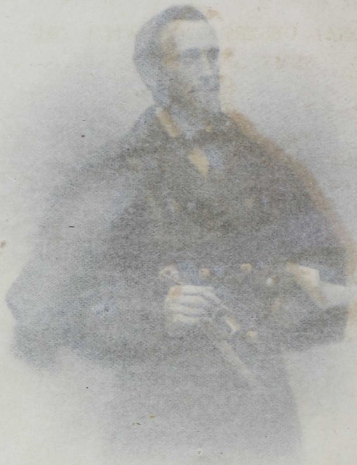
General Grant Charles Cannon Coffin