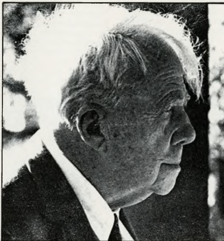
Poet Robert Frost (above) and author Hervey Allen ( Anthony Adverse) were friends and neighbors in South Miami for many years. Before purchasing his own homestead, Frost was a guest at the Allen Home, "The Glades." In 1940, Frost wrote Allen thanking him and his wife "for choosing the plot" for Frost's Miami home, "Pencil Pines." Both men were frequent speakers at the University of Miami's Winter Institute of Literature.