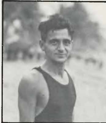
Songwriter Irving Berlin, February 28, 1926