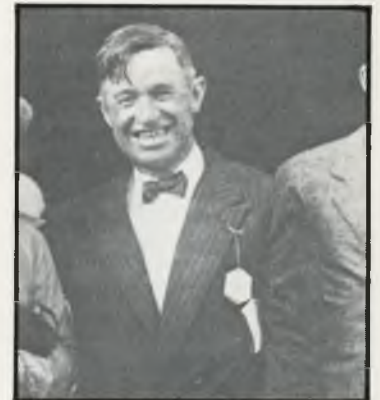
Will Rogers, 1924.