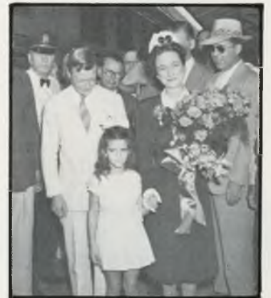
The Duke and Duchess of Windsor, September 24, 1941.