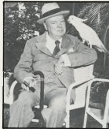
Sir Winston Churchill at the Parrot Jungle.