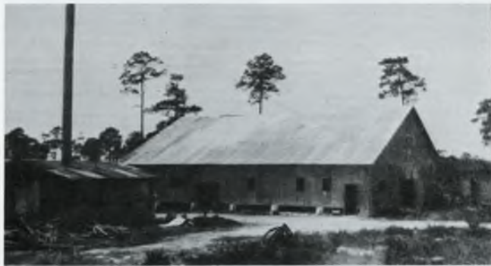
The factory and boiler shed of the A. B. Hurst Co. produced "Florida Arrowroot Starch." The powder was used by soldiers in W.W. I and later was considered a good nutrition source for children.