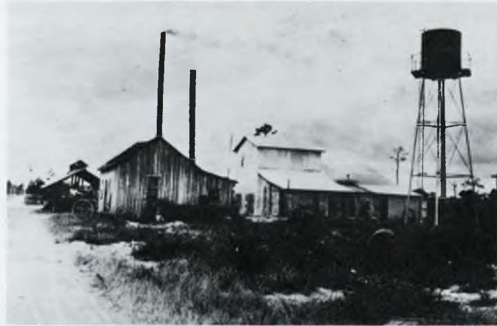
An early Miami tannin factory that extracted the tannic acid used in leather tanning. The first Miami factory was established in 1904.

even higher. Everything used, including all fresh water, had to be brought in. The owners had hoped to use the mangrove lumber left after the debarking as an additional cash product. However, they found no way to dry the