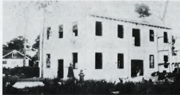
H. F. Fordham built this two story concrete paint factory (above) in 1916 for the commercial production of ocher paint. Below, in 1932, the building became the home of Puritan Dairy. Today it houses Puritan's (Farmbest) accounting offices and is a milk distribution point.

the river banks, pure veins of ocher were found, yellow in