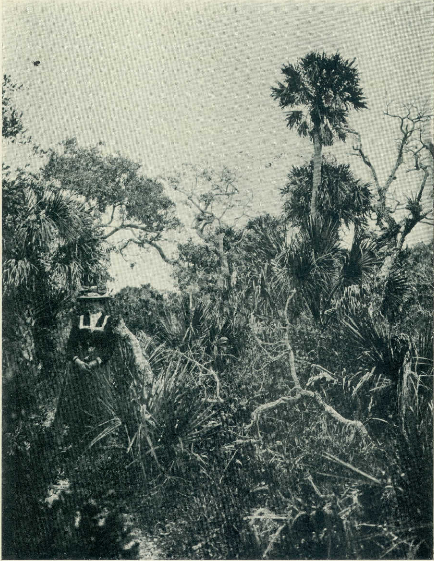
INTERIOR OF AN ALLIGATOR ISLAND. THE HAUNT OF THE RATTLESNAKE, GOPHER, TORTOISE, AND RACCOON.