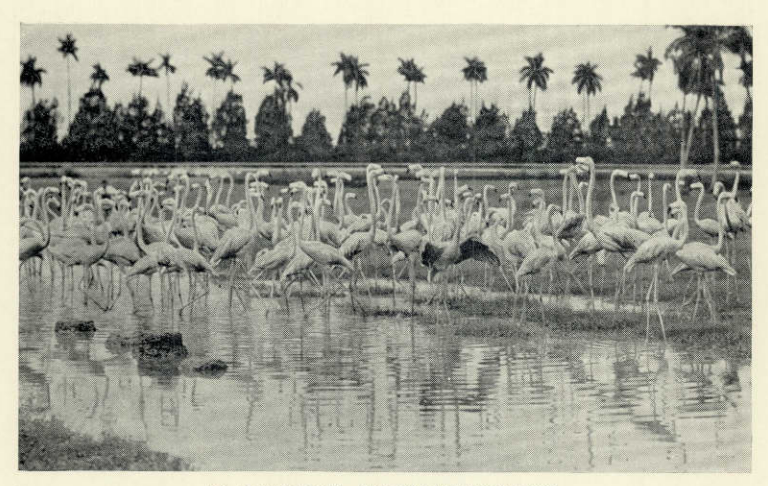
FLAMINGOES AT HIALEAH PARK