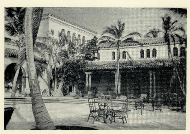
INDIAN CREEK CLUB, MIAMI BEACH