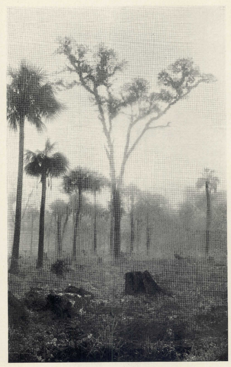
The trees stand like ghosts in the heavy morning mists. (See\ chapter\ 18)