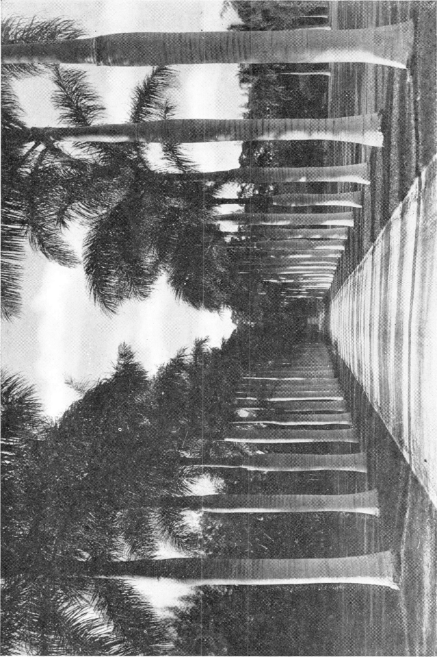
AVENUE OF ROYAL PALMS