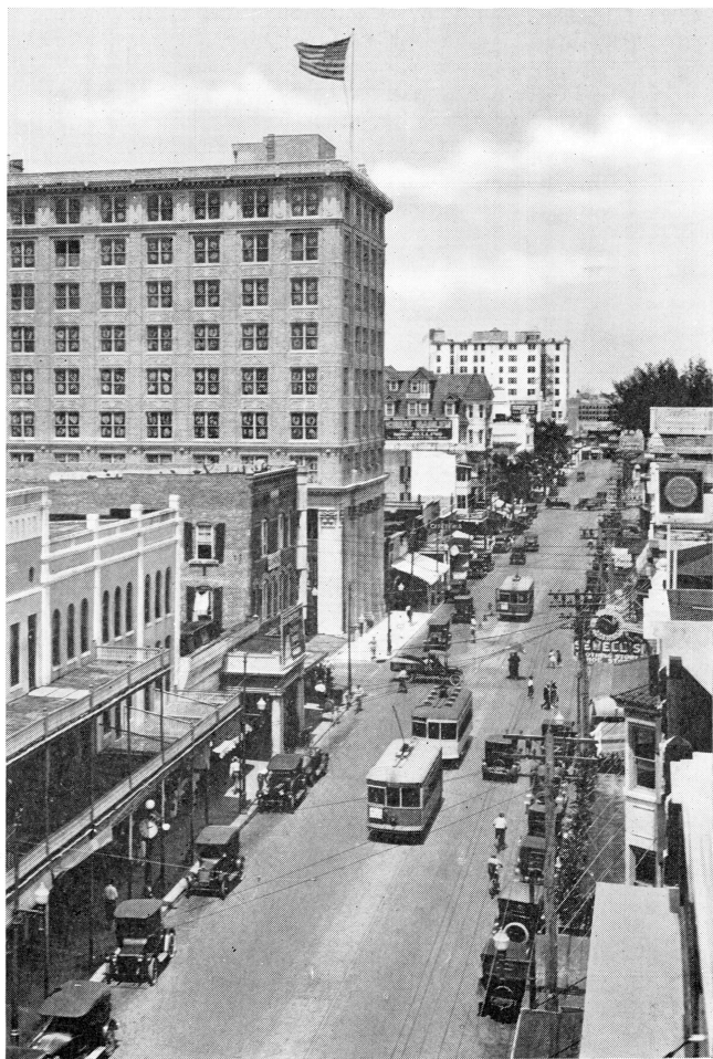
"MAIN STREET"--THE TOWN THAT CLIMATE BUILT