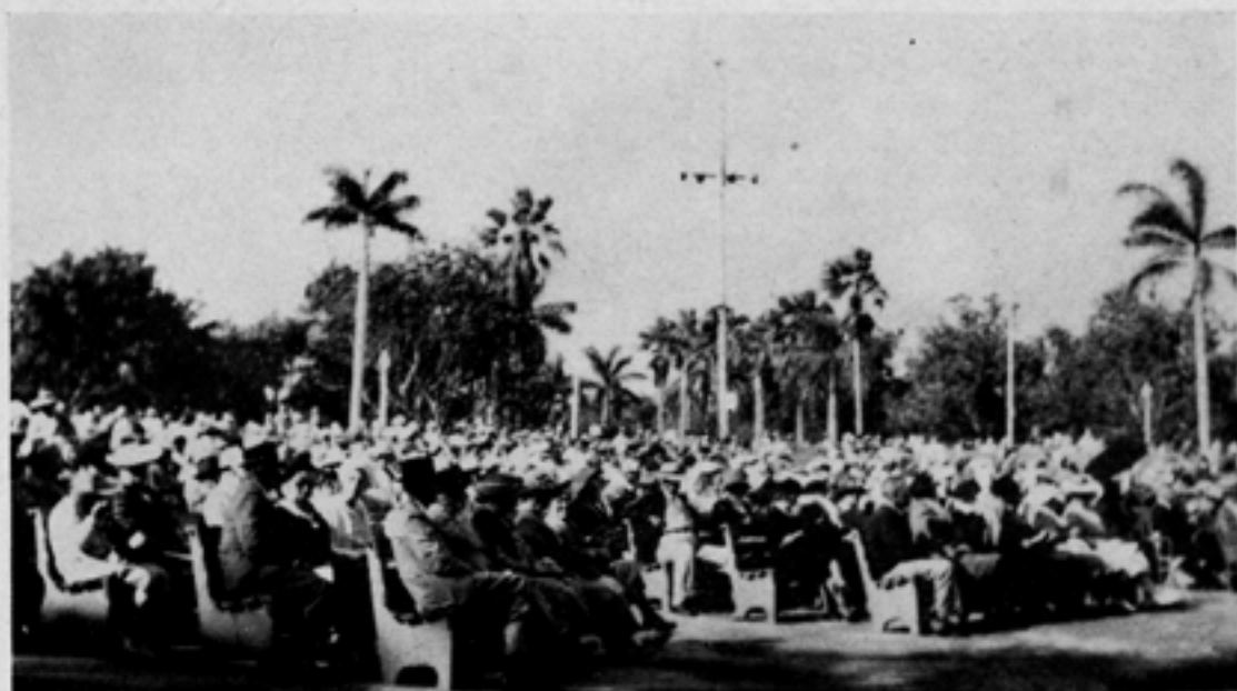
A Group of Eager Listeners

The following brief excerpts from letters recently received will give some idea as to the scope and nature of this service.