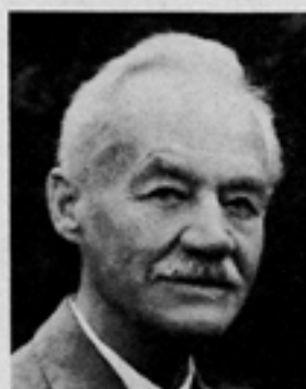
SIR WILFRED THOMAS GREENFELL

was Medical Missionary to Labrador for nearly fifty years, where he built 5 Hospitals, 7 Nursing Stations, 2 Orphanages, 2 Large Schools, Co-operative Stores, etc.