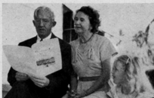
The Lesson-Talk in the Home