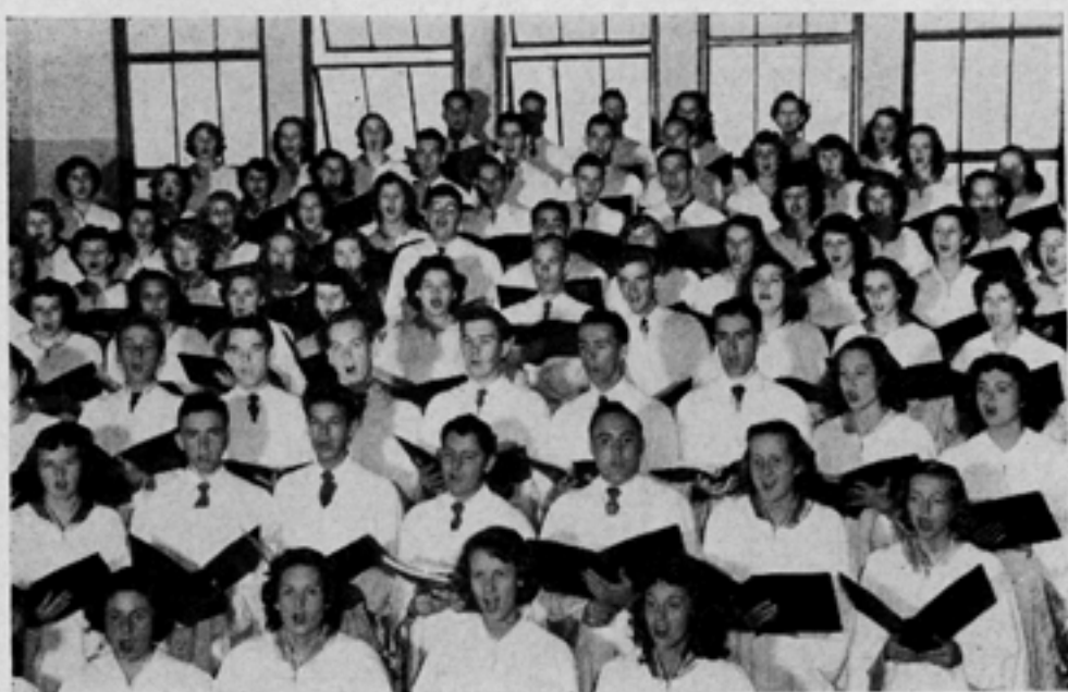
MIAMI SENIOR HIGH SCHOOL CHORUS

The first thirty minutes of each class session is devoted to a program of sacred music; and many of the foremost soloists and musical organizations in the South have appeared on these programs. Among these are: