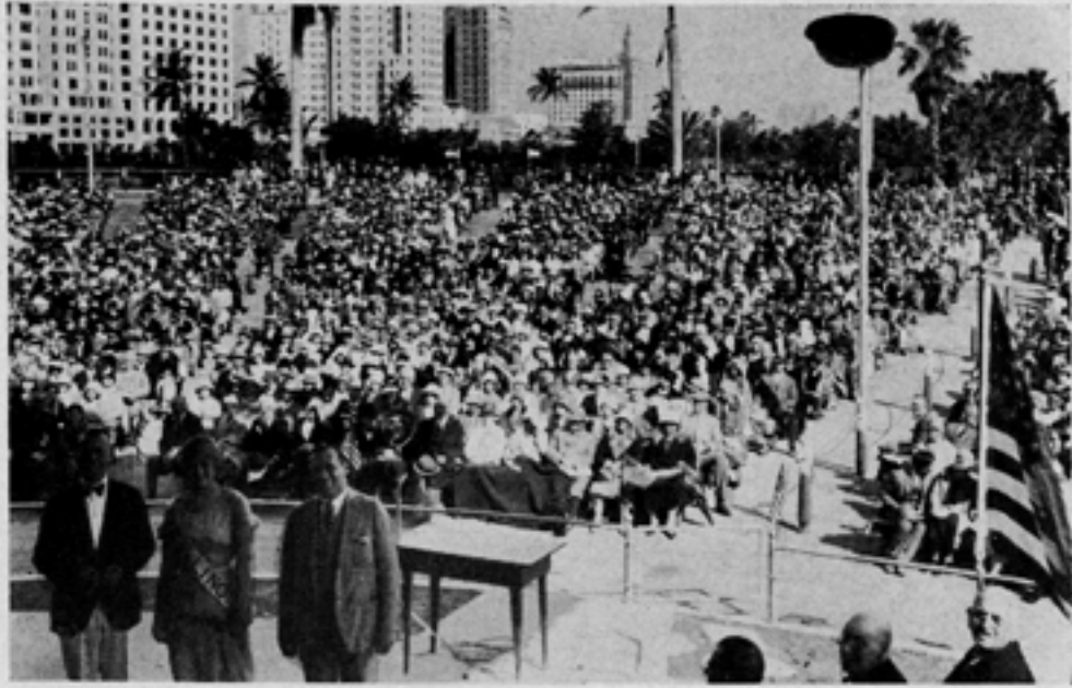
THE OLYMPIA BIBLE CLASS