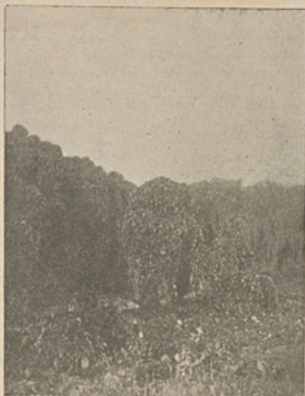
Moon Vines on Custard Apple Trees Near Lake Okeechobee