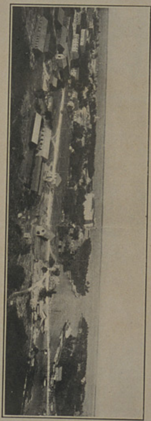
MIAMI CITY AND RIVER, ON BAY BISCAYNE, FLORIDA, LOOKING EAST.

of 2,750 feet per length of canal for dies; and the New ward. I am in- been maintained; impossible to fore- muck lands will der construction. ed, who are in ents in this direc- the excavation of The bids to be This action is ice of the Florida of the drainage ons of June 1st. no further delay